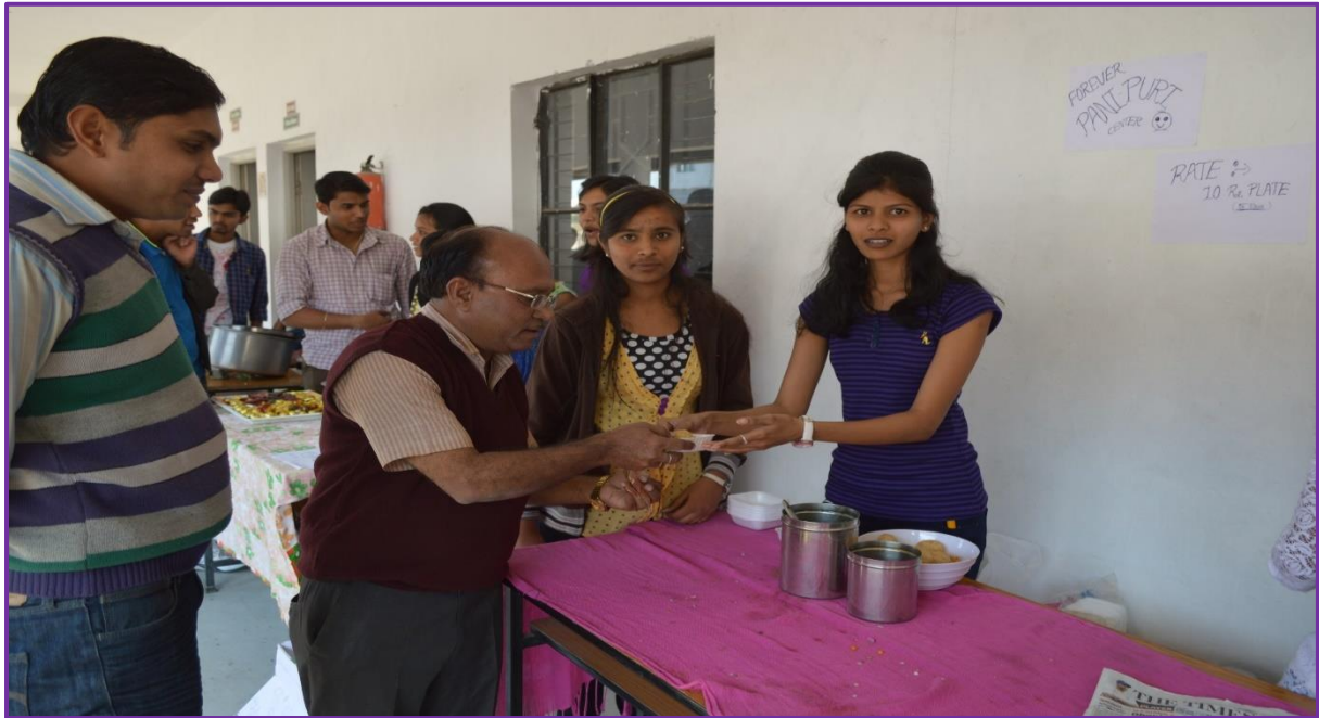
Ganesh chaturthi celebration at Kamla Nehru College of Pharmacy

Borkhedi (gate), Butibori, Nagpur-441 108 (M.S.)